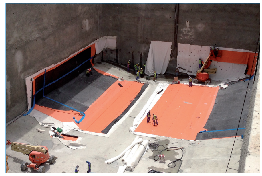
Figure 4: Edmonton