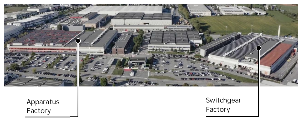
Figure 1 ABB Dalmine

The manufacturing of VD4/P is located in ABB apparatus factory, where circuit breakers are assembled in the so called One Primary Line . All components and subassemblies are produced by ABB's suppliers and are then assembled in the factory.