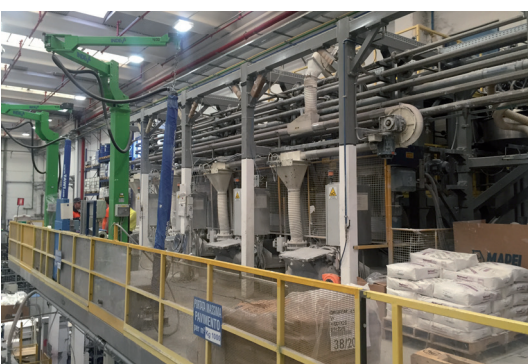
Figure 1: production process

A brief description of production process is the following: The production process starts from raw materials, that are purchased from external and intercompany suppliers and stored in the plant. Bulk raw materials are stored in specific silos and added automatically in the production mixer, according to the formula of the product. Other raw materials, supplied in bags, big bags or plastic 1000 lt IBC, are stored in their warehouse and added automatically or manually in the mixer. The production is a discontinuous process, in which all the components are mechanically mixed in batches. The semifinished product is then packaged in plastic 1000 lt IBC or managed in bulk. The quality of final products is controlled before the sale.