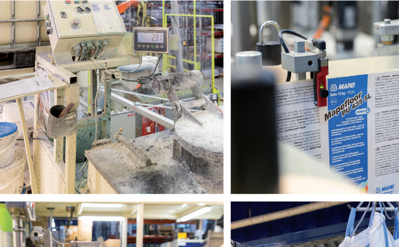
Figure 1: Production process detail - © Photo Halvor Gudim

The production process starts from raw materials, that are purchased from external and intercompany suppliers and stored in the plant. Bulk raw materials are stored in specific tanks and added in the production mixer, according to the formula of the product. Other raw materials, supplied in bags, tanks, drums and cans, are stored in the warehouse and added manually in the mixer. The production is a discontinuous process, in which all the components are mechanically mixed in batches. The semi-finished product is then filled in IBC, drums, buckets or cans, put on wooden pallets and stored in the finished products warehouse. The quality of final products is controlled before the sale.