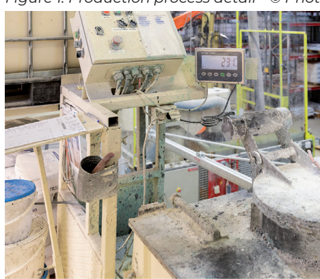
Figure 1: Production process detail

The production process starts from raw materials, that are purchased from external and intercompany suppliers and stored in the plant. Bulk raw materials are stored in specific tanks and added in the production mixer, according to the formula of the product. Other raw materials, supplied in bags, tanks, drums and cans, are stored in the warehouse and added manually in the mixer. The production is a discontinuous process, in which all the components are mechanically mixed in batches. The semi-finished product is then filled in IBC, drums, buckets or cans, put on wooden pallets and stored in the finished products warehouse. The quality of final products is controlled before the sale.