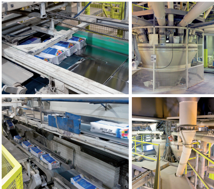
Figure 1: production process - © Photo Dirk Gruner