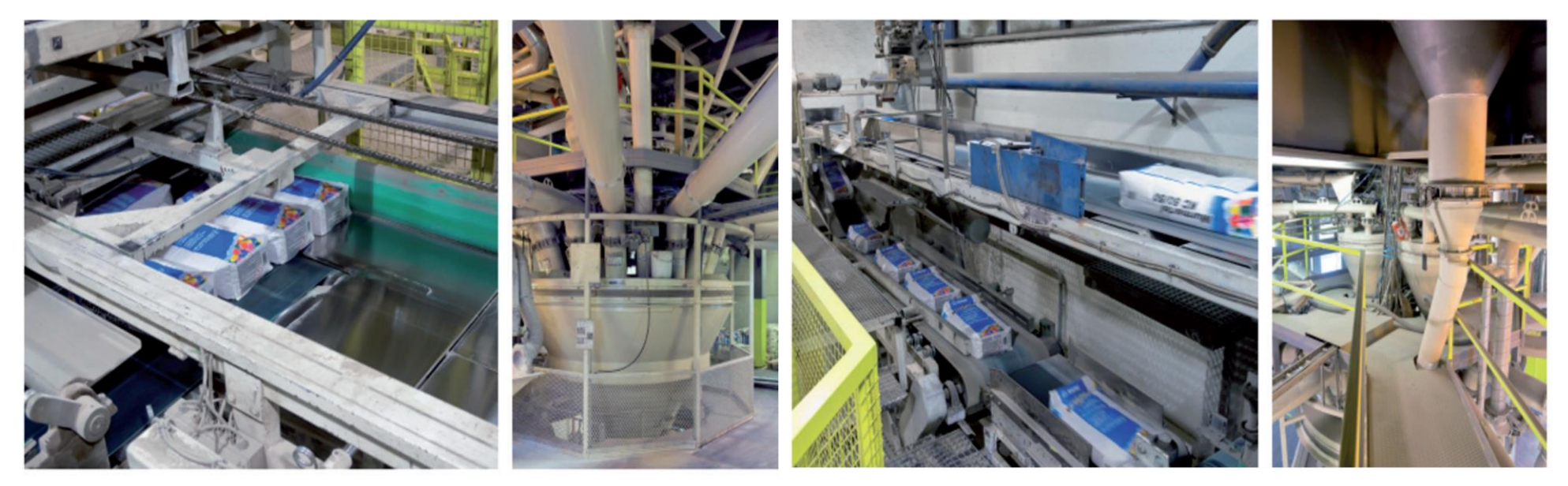
Figure 1: production process detail

The production process starts from raw materials, that are purchased from external and intercompany suppliers and stored in the plant. Bulk raw materials are stored in specific silos and added automatically in the production mixer, according to the formula of the product. Other raw materials, supplied in bags, big bags or tanks, are stored in the warehouse and added automatically or manually in the mixer. The production is a discontinuous process, in which all the components are mechanically mixed in batches. The semi-finished product is then packaged, put on wooden pallets and stored in the finished products warehouse. The quality of final products is controlled before the sale.