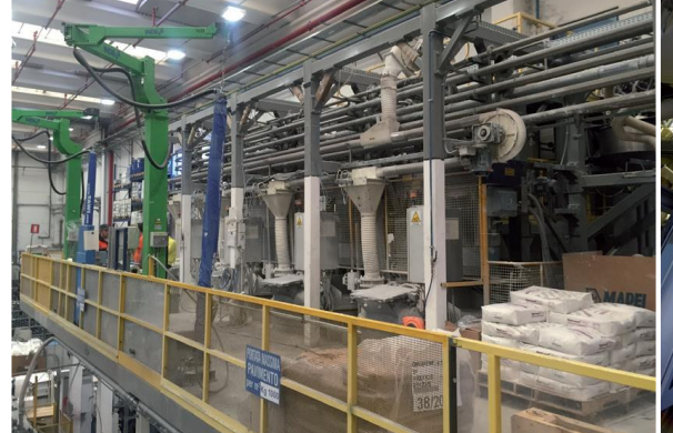
Figure 1: production process detail

The production process starts from raw materials, that are purchased from external and intercompany suppliers and stored in the plant. Bulk raw materials are stored in specific silos and added automatically in the production mixer, according to the formula of the product. Other raw materials, supplied in bags, big bags or tanks, are stored in the warehouse and added automatically or manually in the mixer. The production is a discontinuous process, in which all the components are mechanically mixed in batches. The semi-finished product is then packaged, put on wooden pallets and stored in the finished products warehouse. The quality of final products is controlled before the sale.