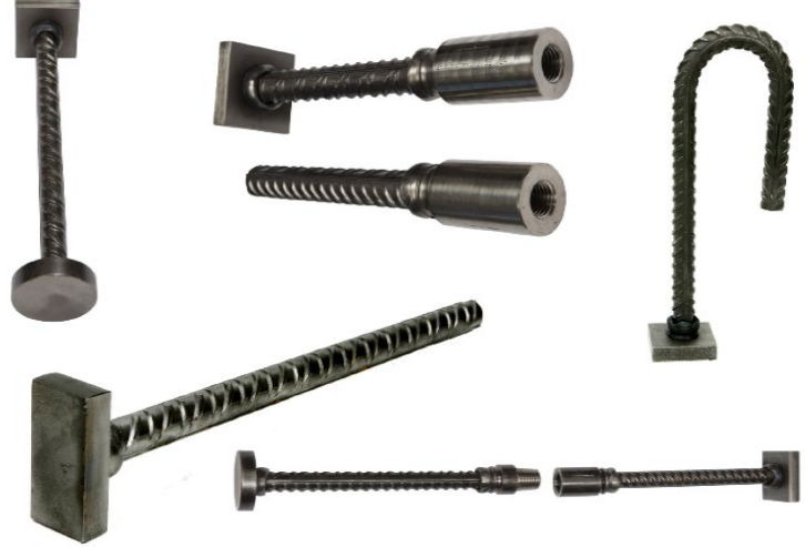
Figure 1 Examples of HRC products: HRC100 Series T-headed bars, HRC400 Series rebar couplers, and HRC720 threated sleeves

The rebar is cut to length according to the production order. Small, unusable cut-off lengths are collected and sent to recycling. The raw material for end-components is cut to correct length/geometry. Threaded components (rebar couplers and cast-in connections) are processed by CNC-machines. Small, unusable cut-off lengths and swarf from cutting and CNC-machining are collected and sent to recycling. The end components are attached to the rebar by friction welding. The process uses no additional material or consumables. If required by the production order, products are bent by a rebar bending machine.