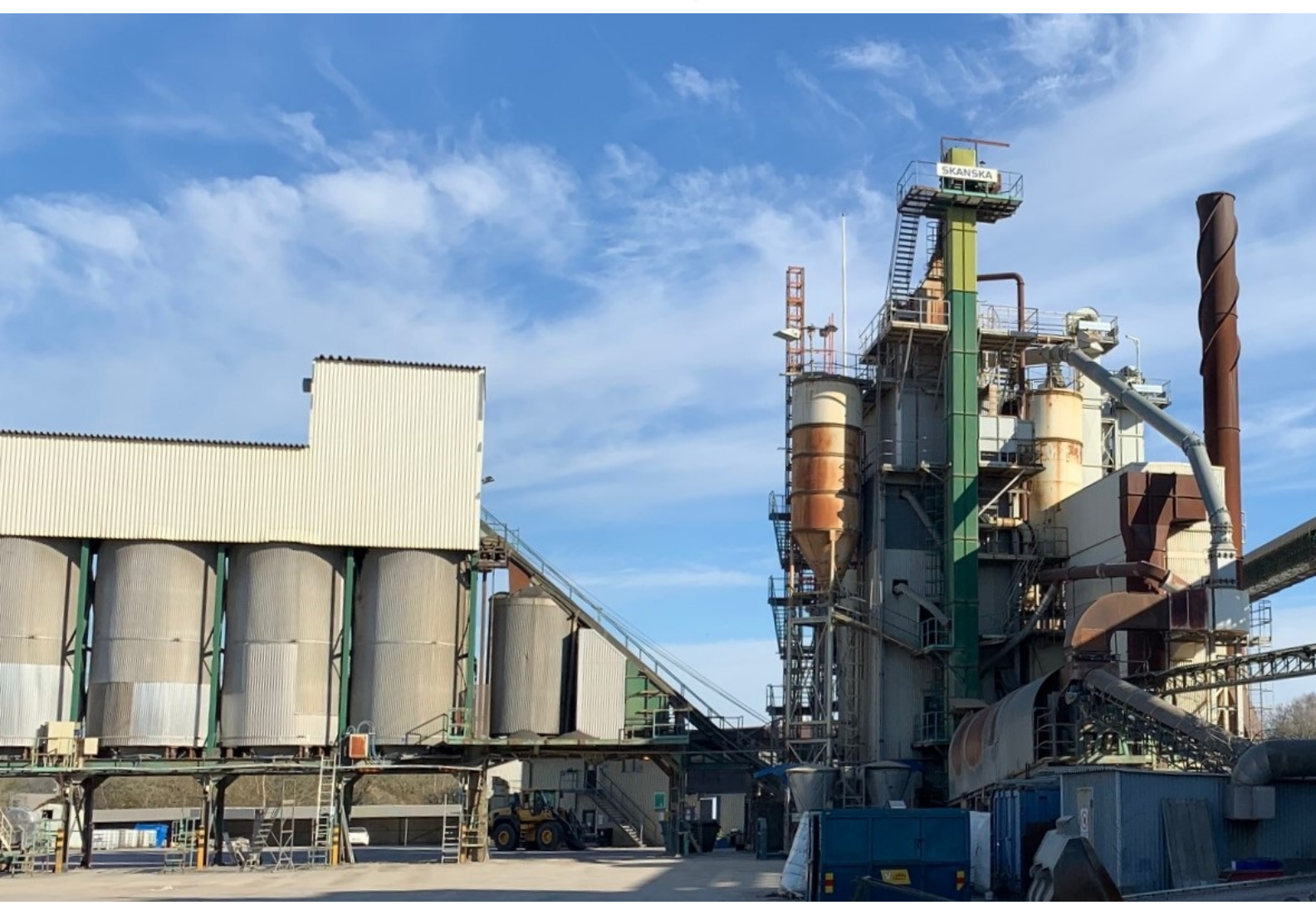
ABb PMB, Skanska Industrial Solutions, Dalby asfaltverk

in accordance with ISO 14025 and EN 15804+A2