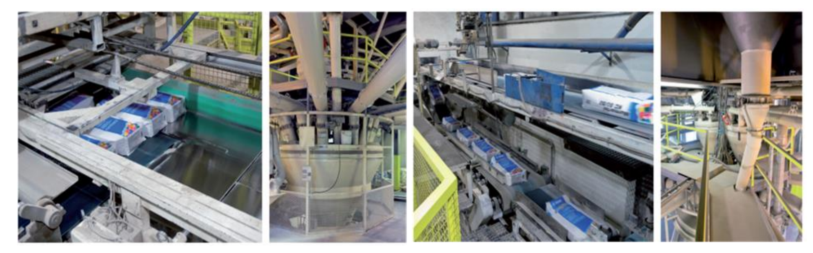
Figure 1: production process detail

The production process starts from raw materials, that are purchased from external and intercompany suppliers and stored in the plant. Bulk raw materials are stored in specific silos and added automatically in the production mixer, according to the formula of the product. Other raw materials, supplied in bags, big bags or tanks, are stored in the warehouse and added automatically or manually in the mixer. The production is a discontinuous process, in which all the components are mechanically mixed in batches. The semi-finished product is then packaged, put on wooden pallets and stored in the finished products warehouse. The quality of final products is controlled before the sale.